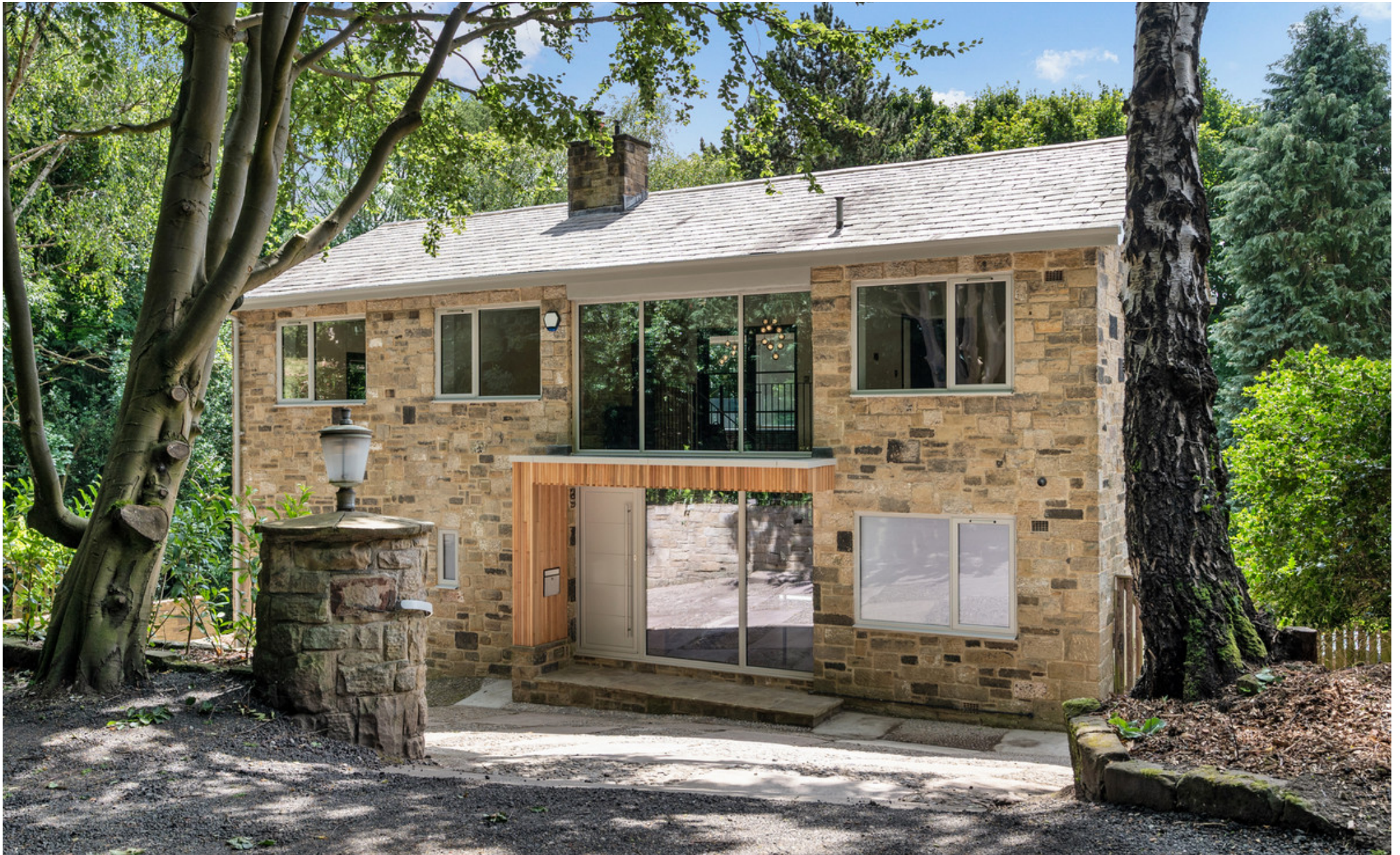
New House, Cragg Wood Drive, Rawdon, LS19 6LG