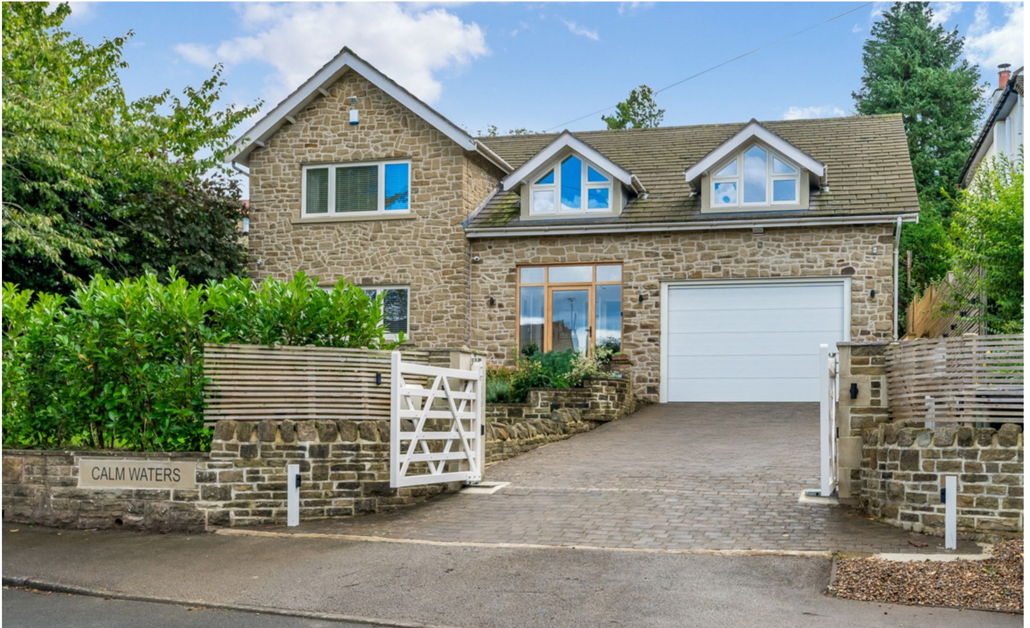
Calm Waters, 3 Langwith Valley Road, Collingham, LS22 5NU