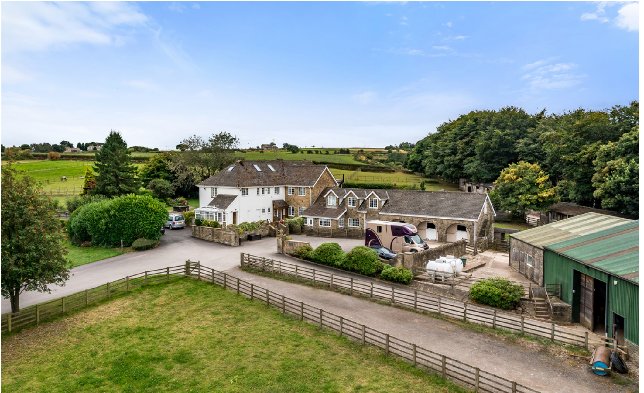
Broomfield House, Bank Lane, Upper Denby, HD8 8UT