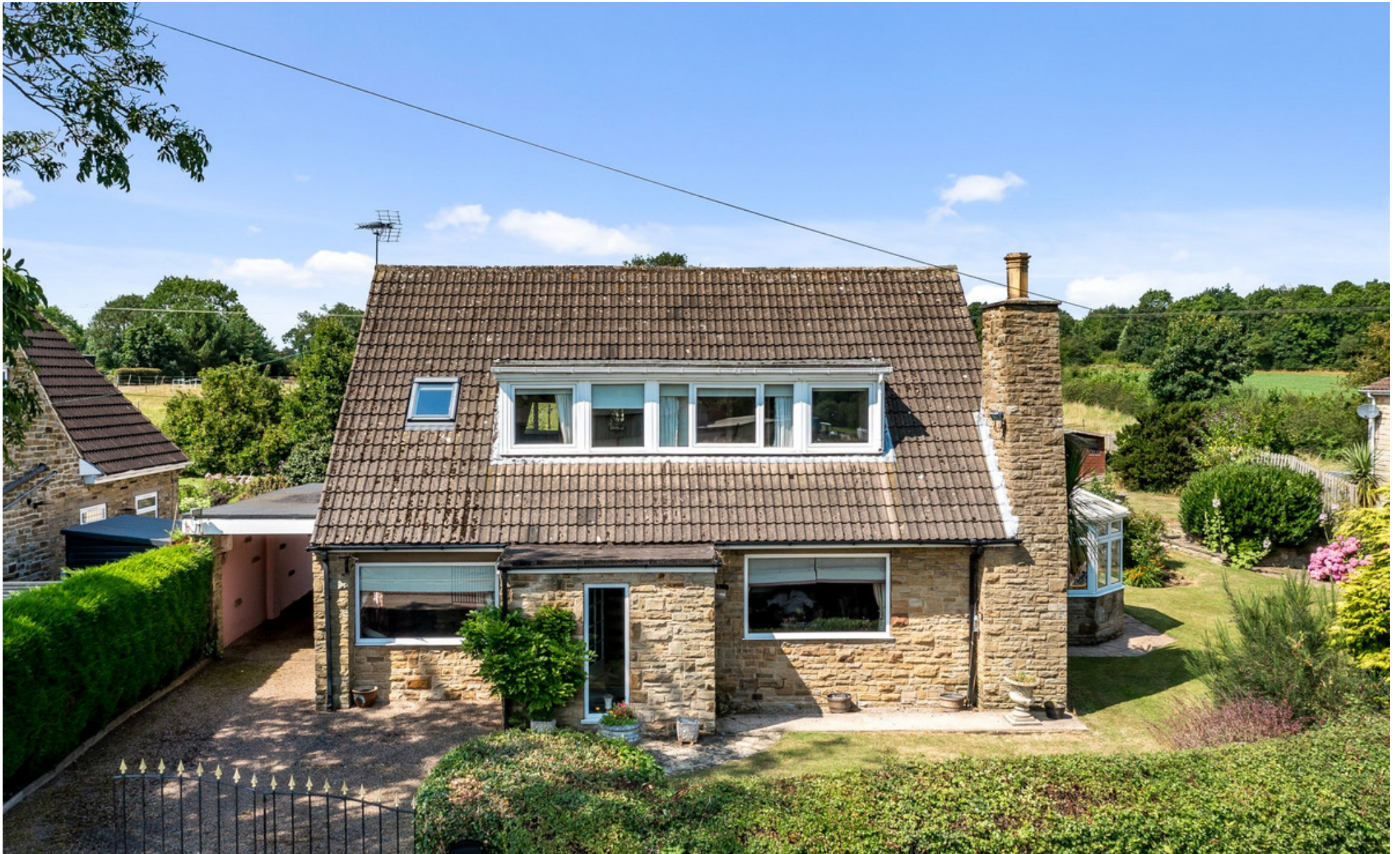
Wind Willow, Church Lane, Stutton, LS24 9BH