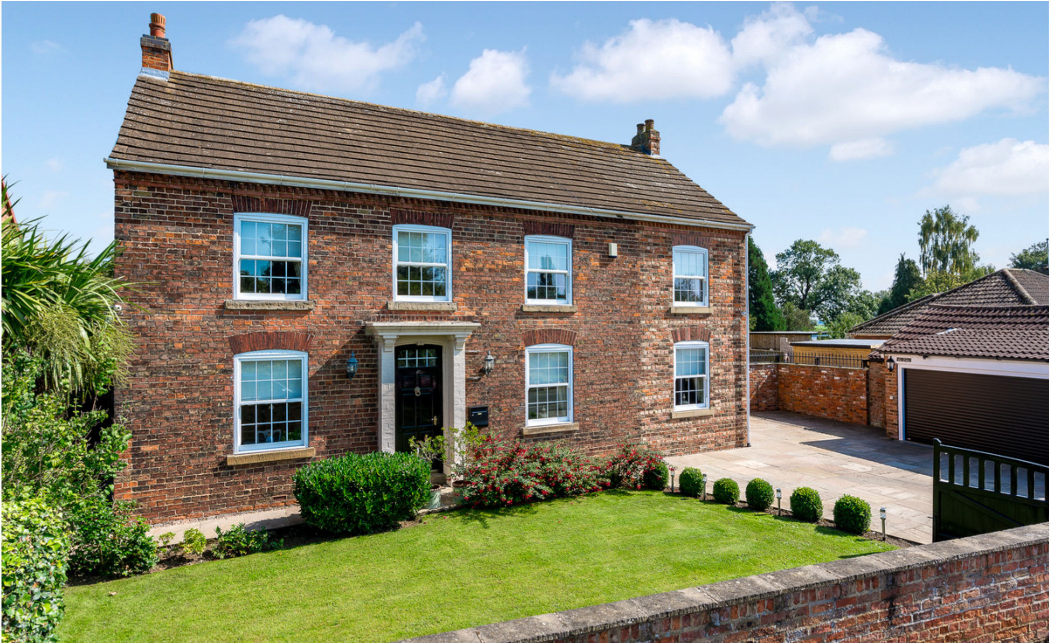
Brantwood, Nanny Lane, Church Fenton, Tadcaster, LS24 9RL