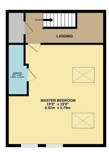
TOTAL FLOOR AREA: 1549 sq.ft. (143.9 sq.m.) approx.

1ST FLOOR 475 sq.ft. (44.1 sq.m.) approx