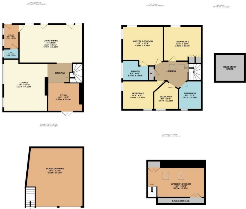
TOTAL FLOOR AREA : 2200 sq.ft. (204.4 sq.m.) approx.