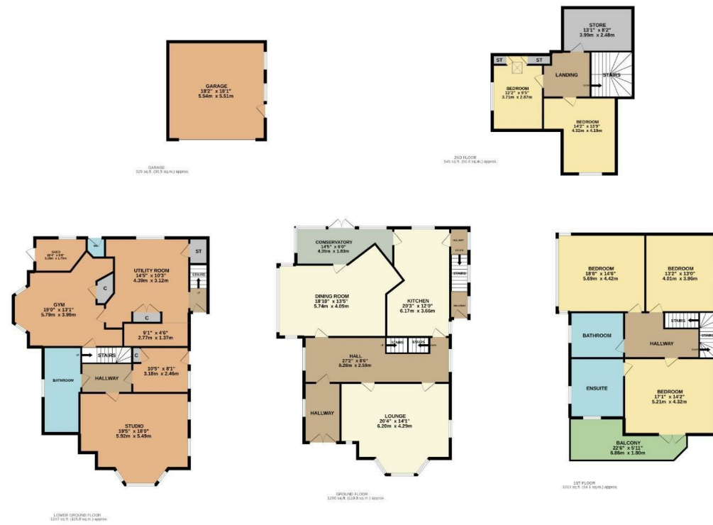
TOTAL FLOOR AREA : 4661sq.ft. (433.0 sq.m.) approx.