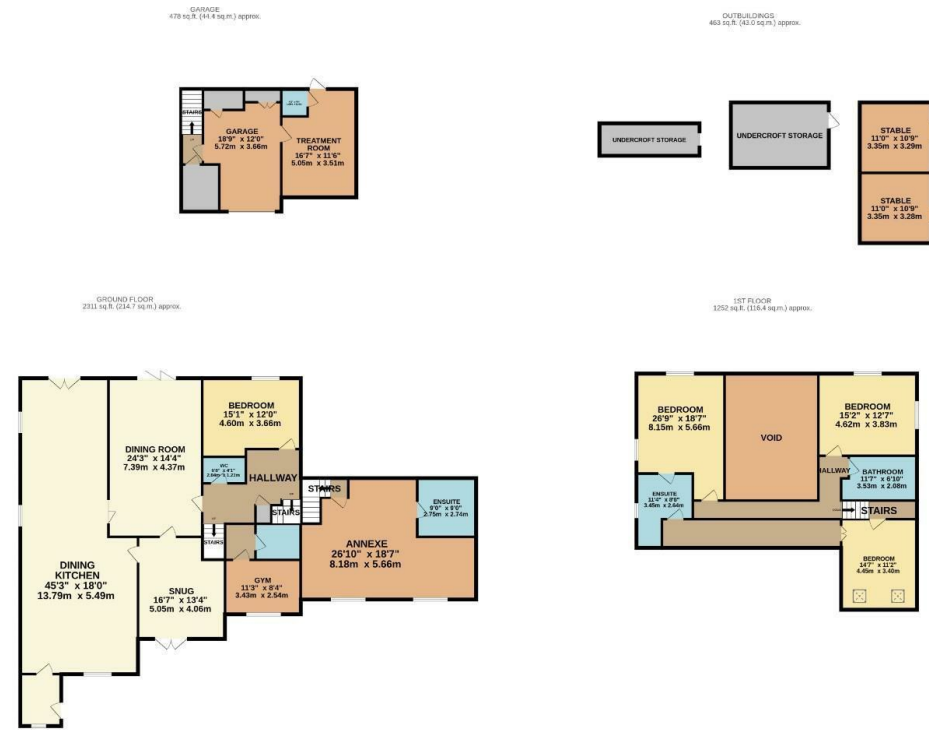
TOTAL FLOOR AREA : 4504 sq.ft. (418.5 sq.m.) approx.