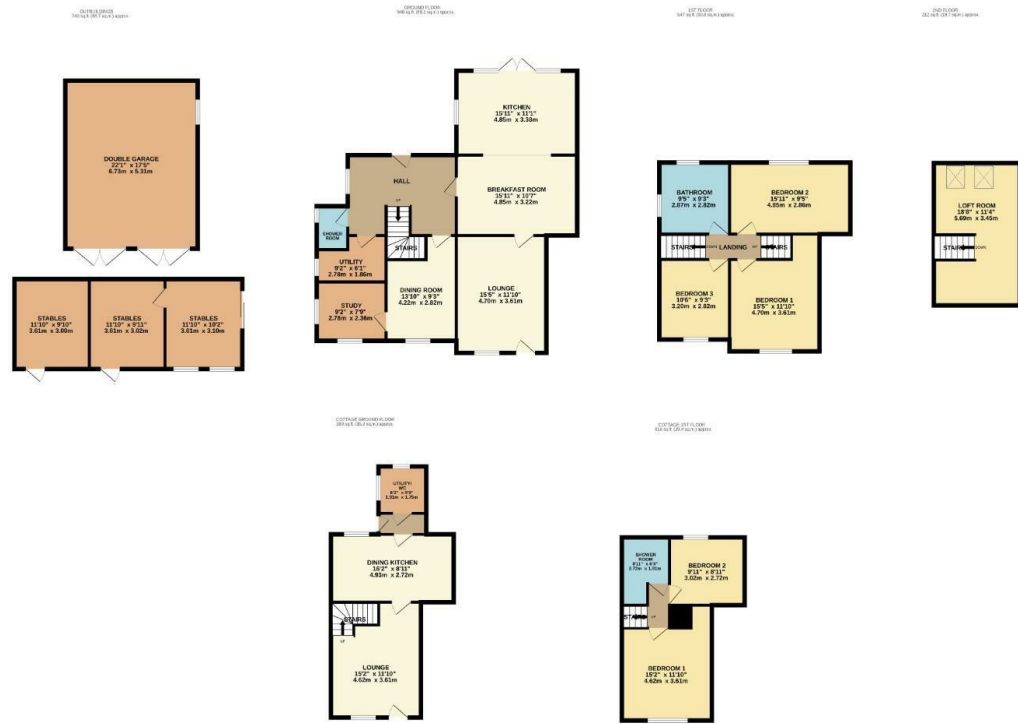
TOTAL FLOOR AREA : 3142 sq.ft. (291.9 sq.m.) approx.