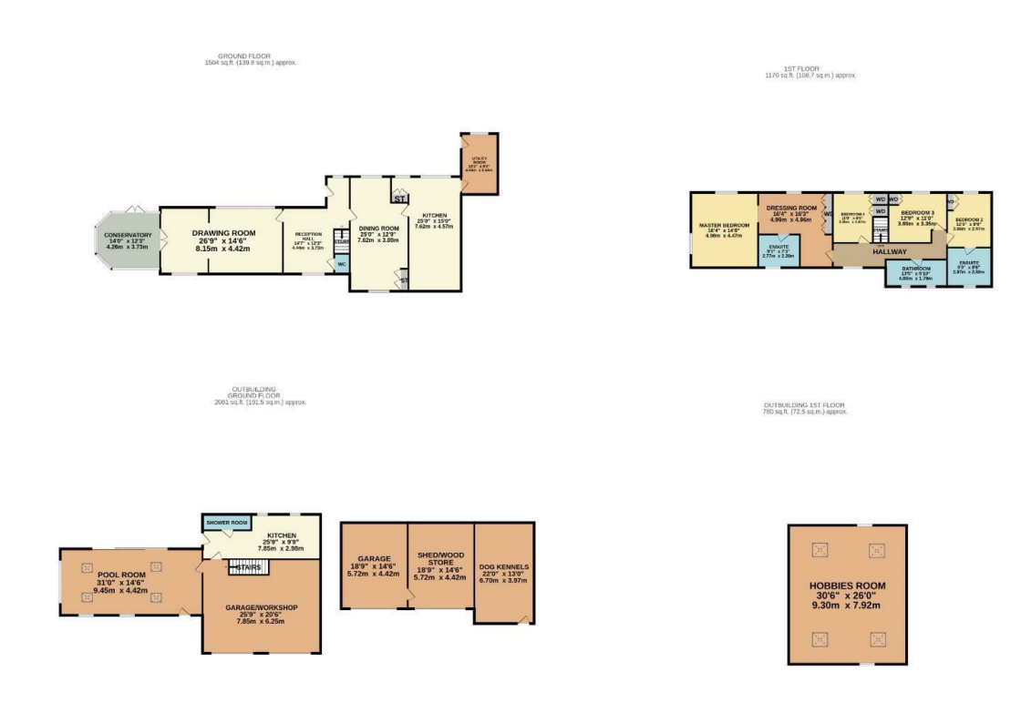
TOTAL FLOOR AREA: 5515 sq.ft. (512.4 sq.m.) approx.