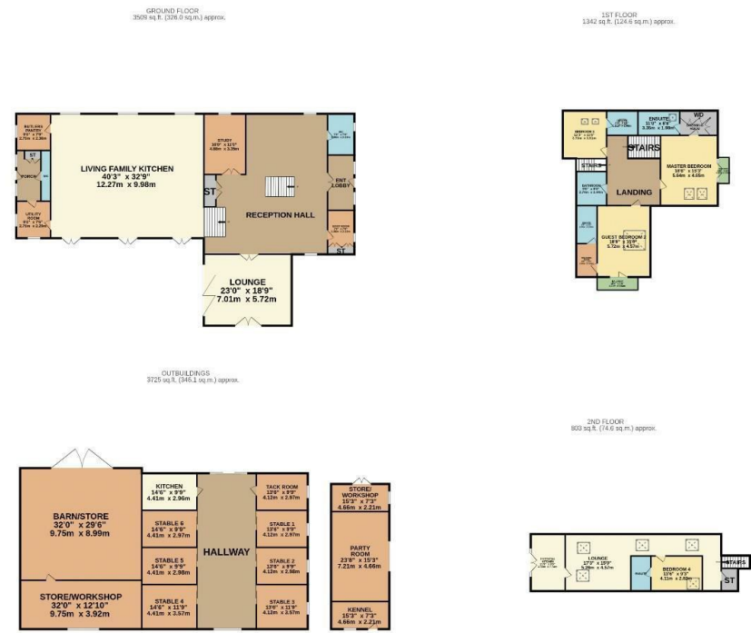
TOTAL FLOOR AREA : 9378 sq.ft. (871.3 sq.m.) approx.