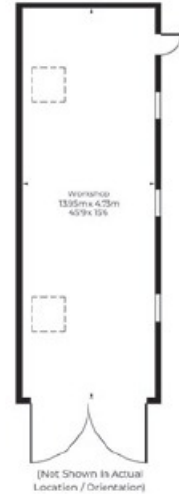
[Not Shown in Actual Location / Orientation]