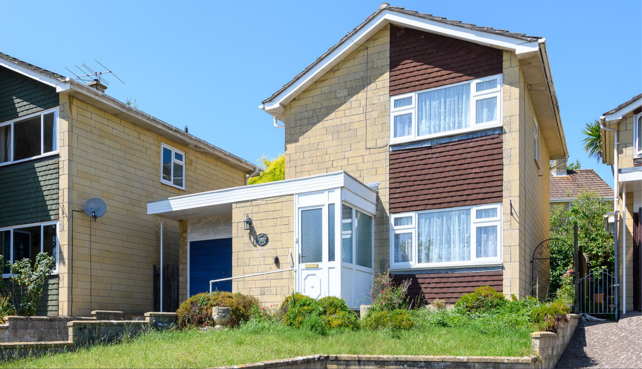
26 The Pastures Lower Westwood, Bradford on Avon, Wiltshire, BA15 2BH