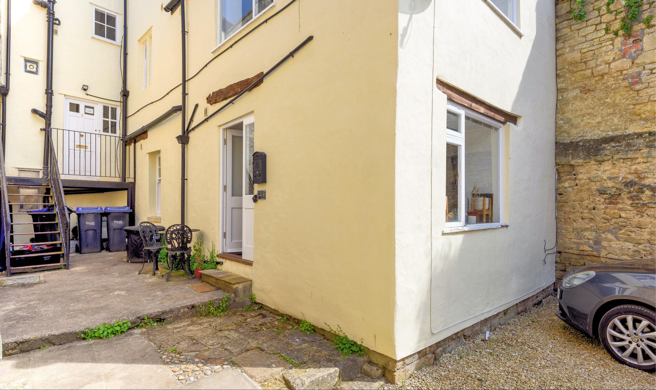
Garden Flat 3 Bull Pit, Bradford on Avon, Wiltshire, BA15 1NB