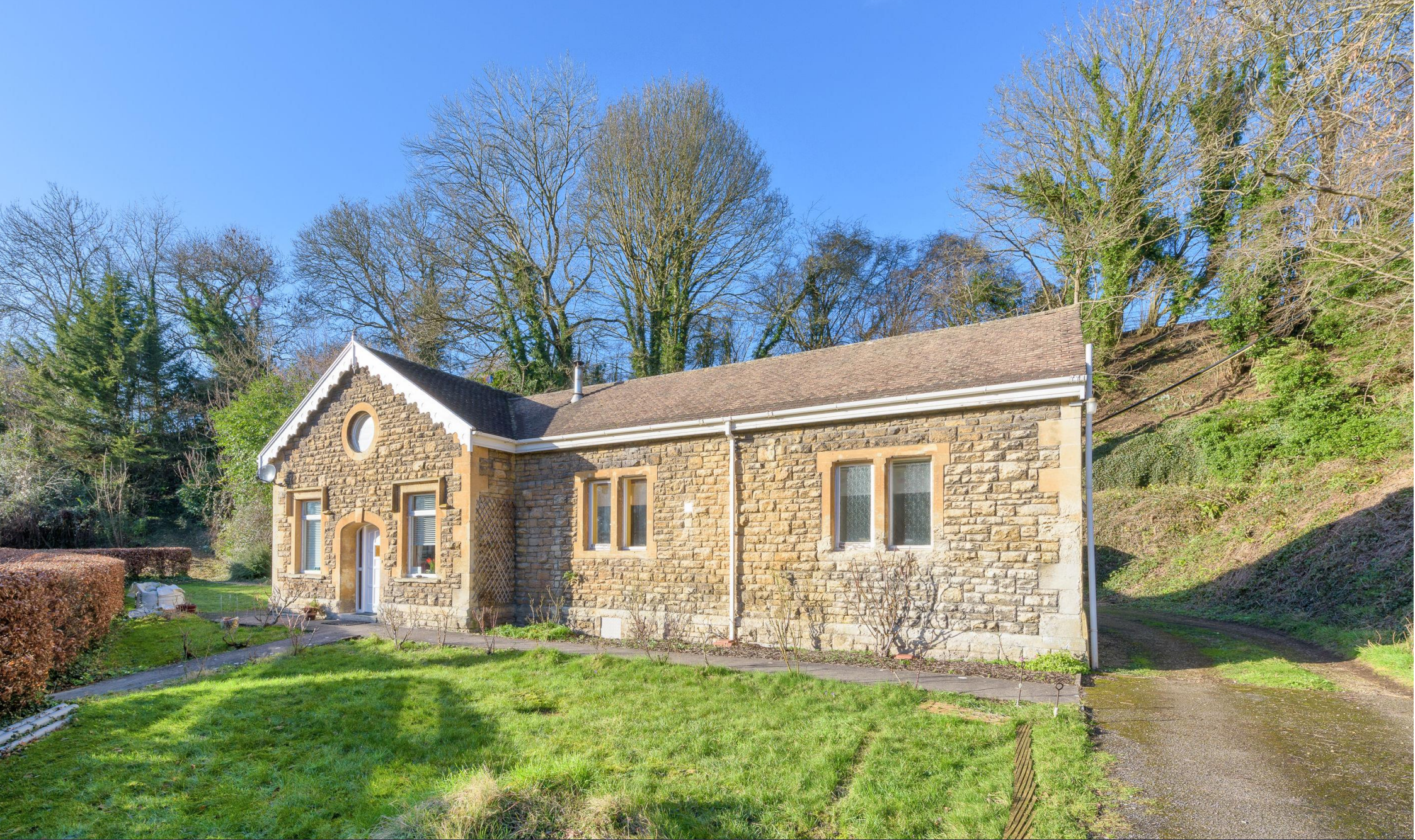
The Old Pumthouse 268a Avoncliff, Bradford on Avon, Wiltshire, BA15 2HA