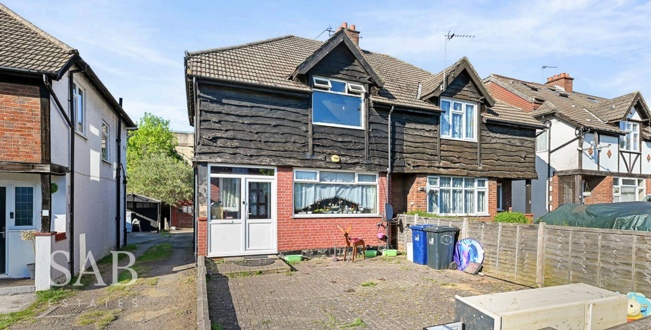
Bennetts Avenue, Greenford £600,000