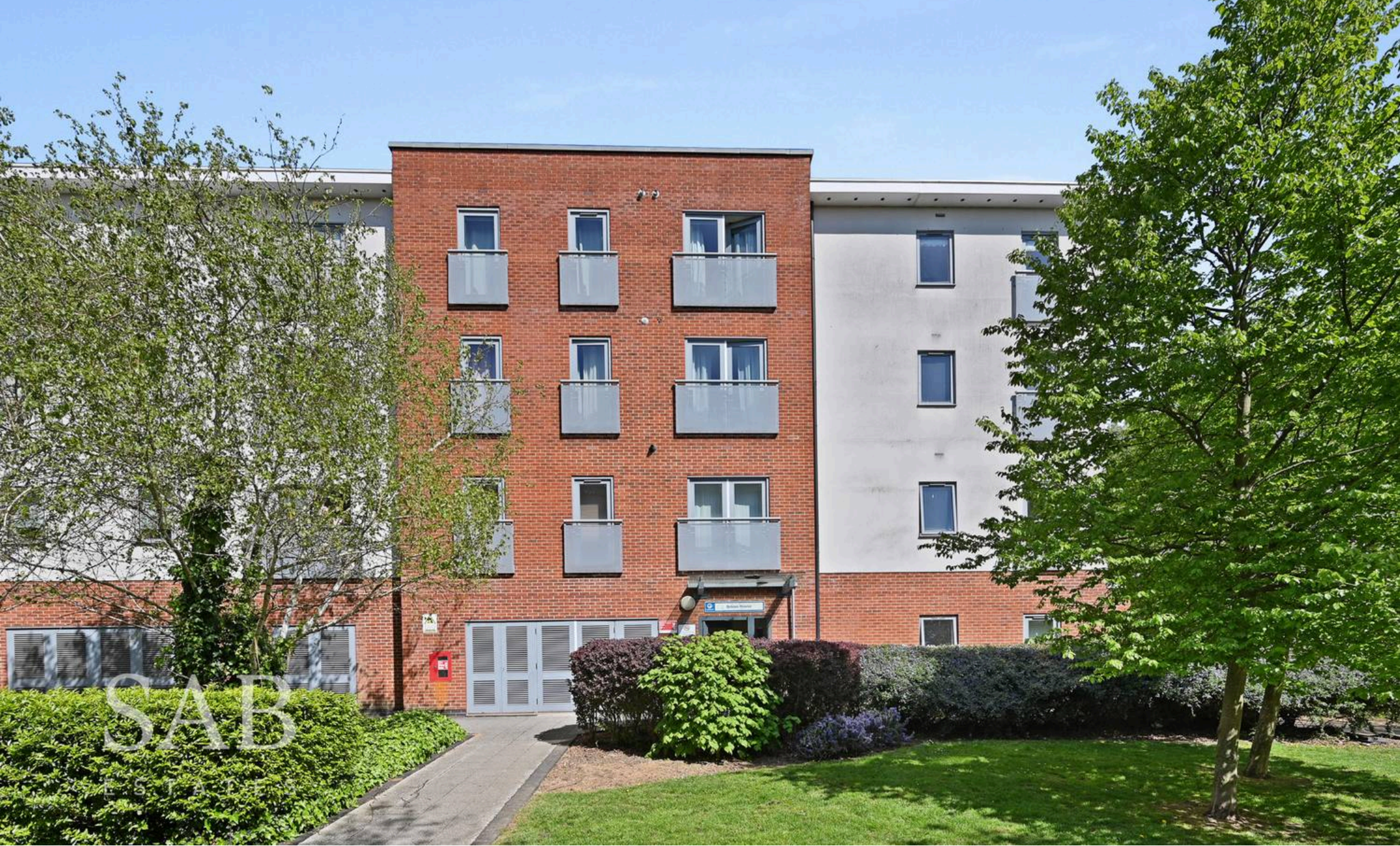
Brecon House, Taywood Road, Northolt £345,000