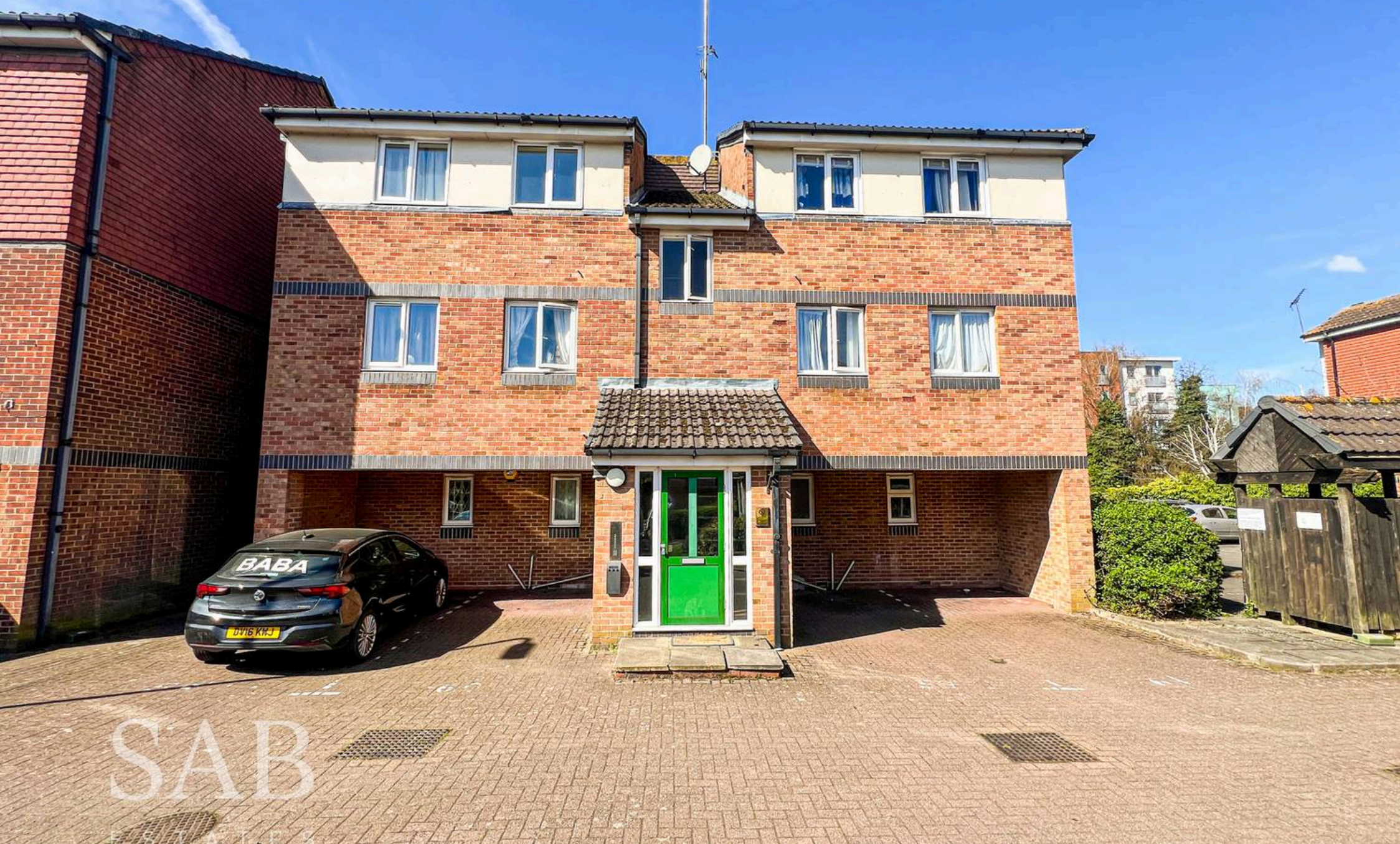
Frensham Close, Southall £269,500