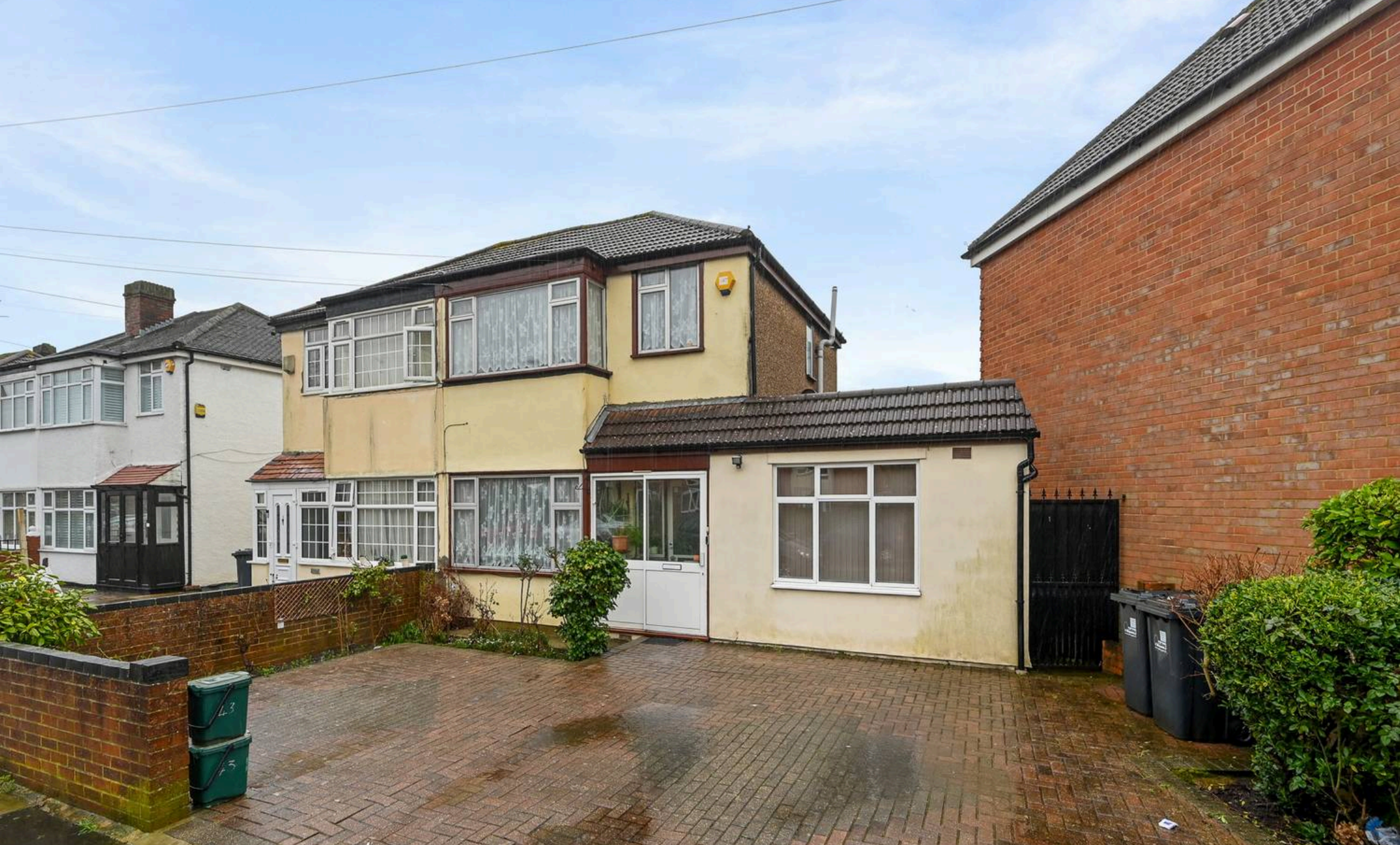
Adrienne Avenue, Southall £612,500