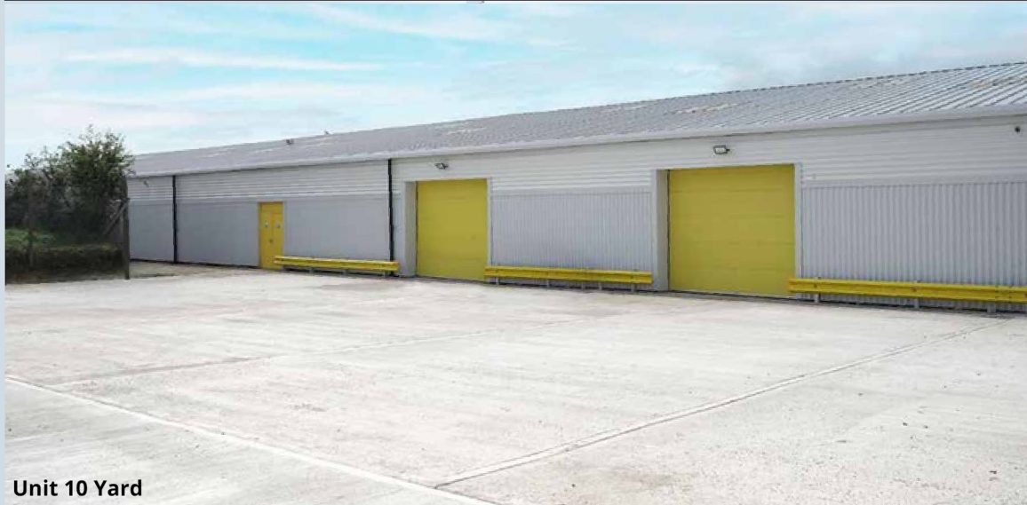
Unit 10 Yard