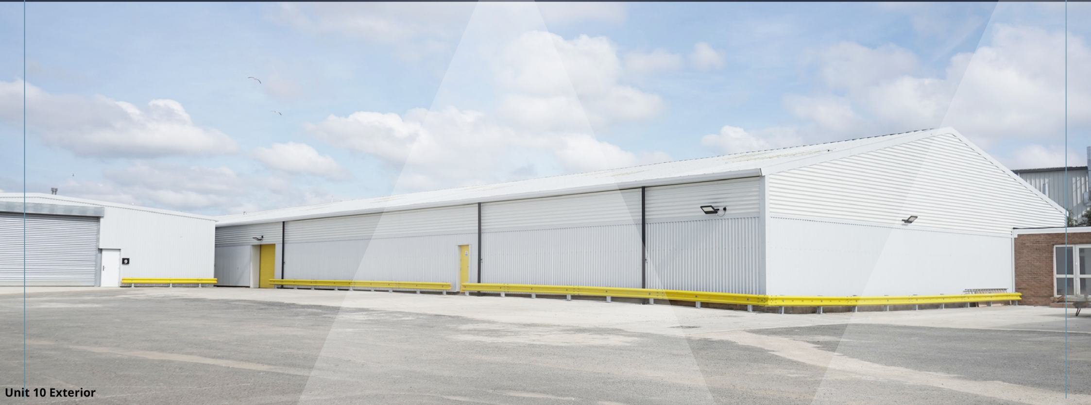
Unit 10 Exterior