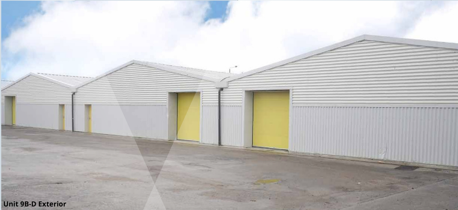
Unit 9B-D Exterior