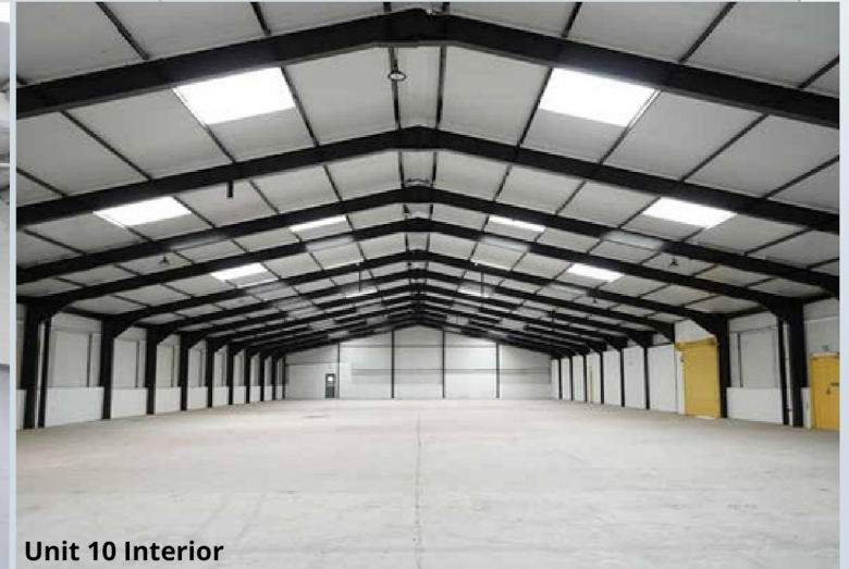
Unit 10 Interior