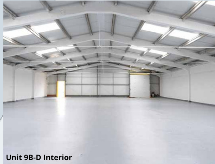
Unit 9B-D Interior

Huntingdon is approximately 60 miles north of London, 16 miles West of Cambridge and 19 miles south of Peterborough.