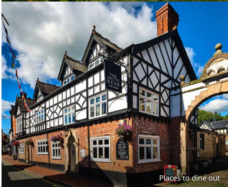
Places to dine out