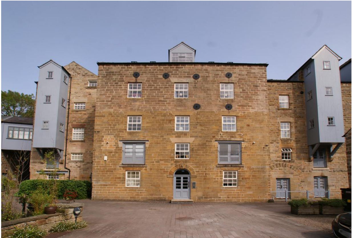
3 Baileys Mill , Bentley Brook, Matlock, DE4 5NR £825 pcm