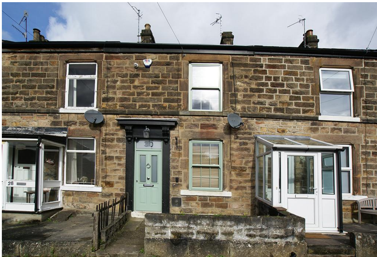
30 Richmond Terrace , New Street , Matlock, DE4 3DN £975 pcm