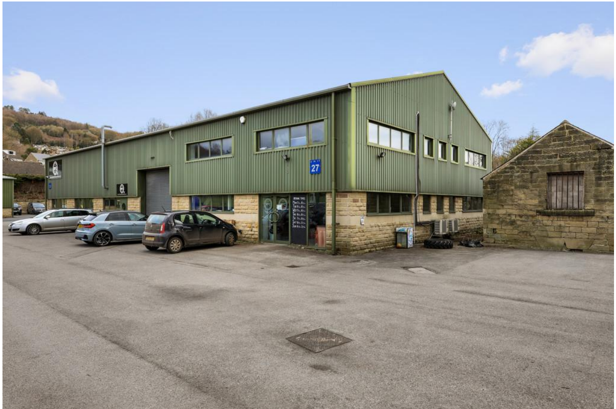
Unit 27, Molyneux Business Park Ltd, Whitworth Road, Darley Dale, Matlock, DE4 2HJ £11,004 pa