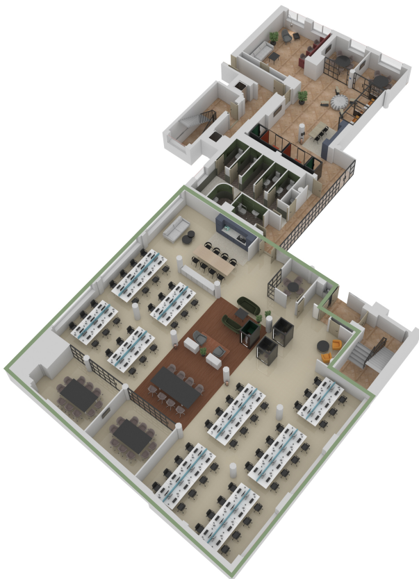
AXO IMAGE OF SUGGESTED OFFICE LAYOUT