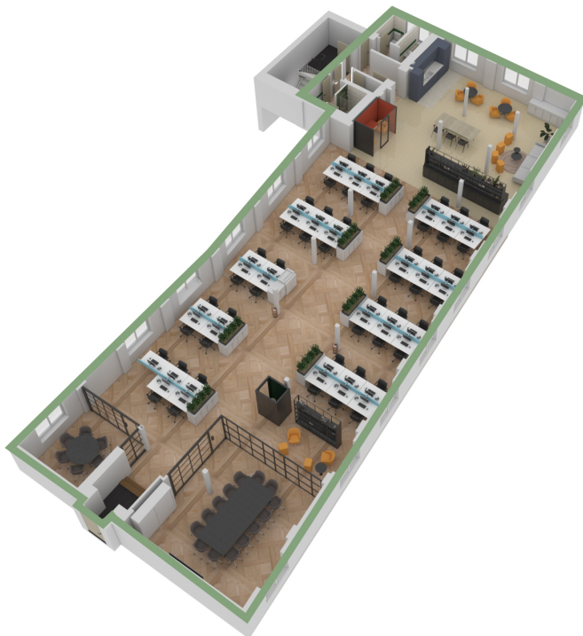
AXO IMAGE OF SUGGESTED OFFICE LAYOUT