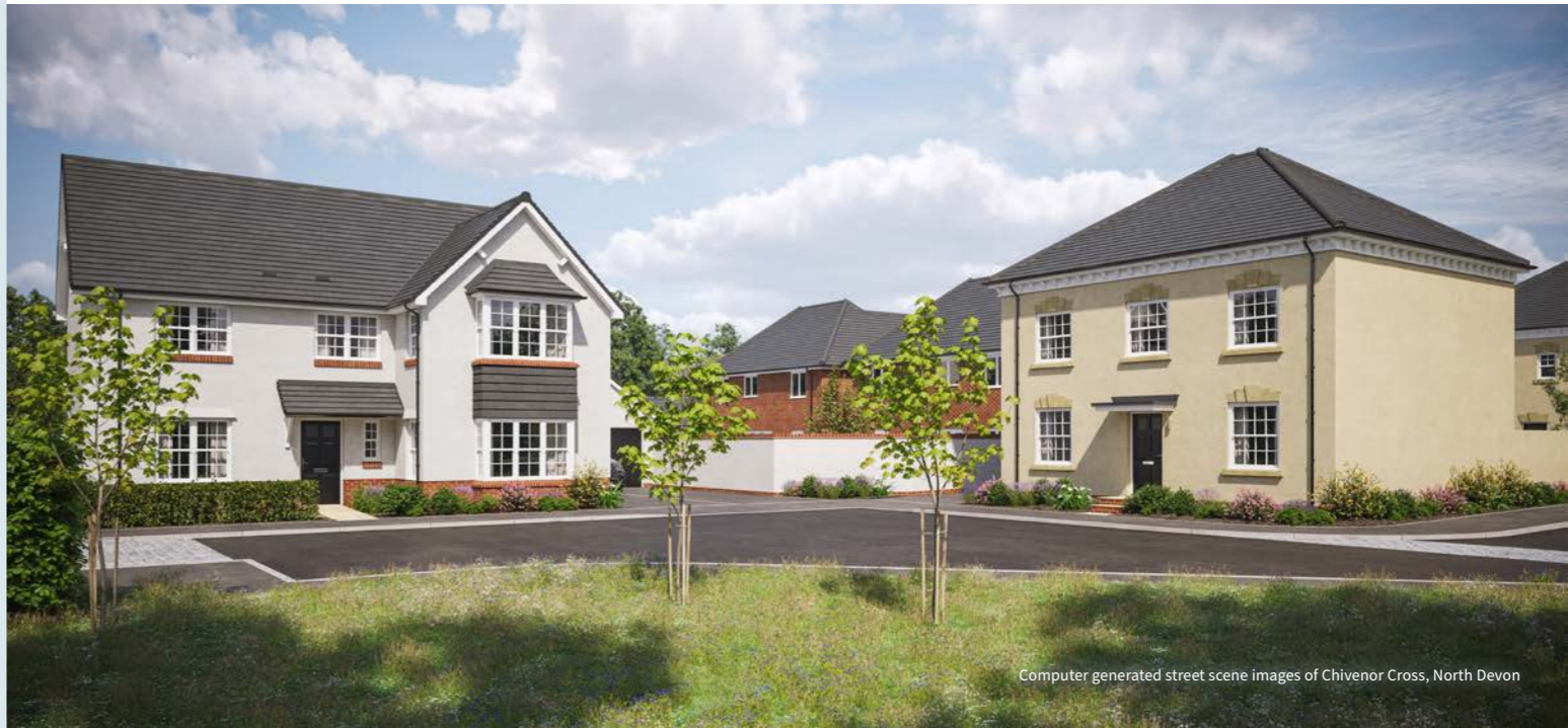
Computer generated street scene images of Chivenor Cross, North Devon