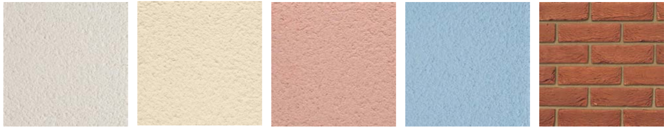
Natural White Render Pale Yellow Render Strong Pink Render Sky Blue Render Red Brick

The finish of each home at Chivenor Cross is carefully considered. We build using a variety of sympathetic finishes, either individually or in combination, which are paired with a pan or plain tiled roof and complemented white windows. Please consult with our Sales Advisor for specific plot finishes.