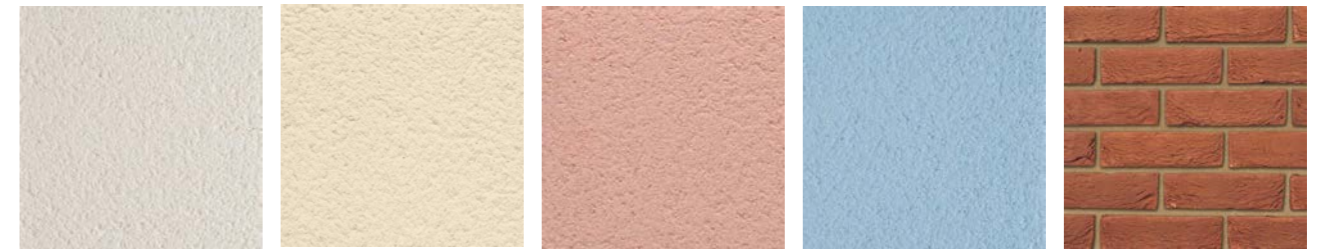
Natural White Render Pale Yellow Render Strong Pink Render Sky Blue Render Red Brick

The finish of each home at Chivenor Cross is carefully considered. We build using a variety of sympathetic finishes, either individually or in combination, which are paired with a pan or plain tiled roof and complemented white windows. Please consult with our Sales Advisor for specific plot finishes.