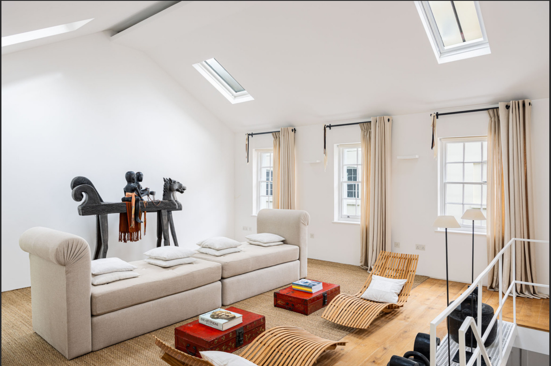
A bright and unique recently refurbished mews house, tucked away in the heart of Belgravia.