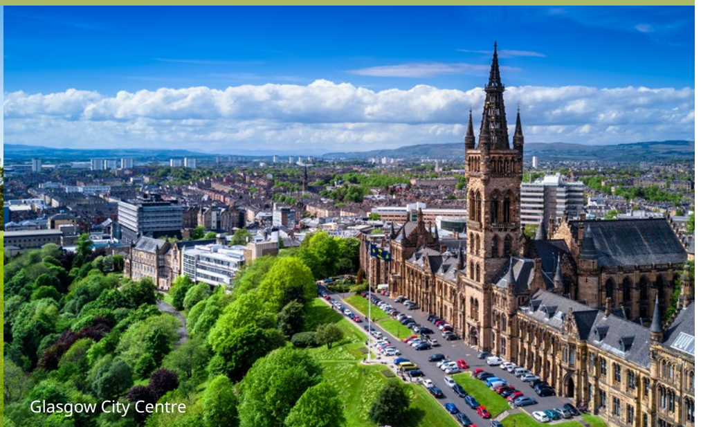
Glasgow City Centre