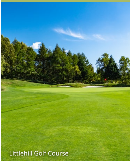
Littlehill Golf Course