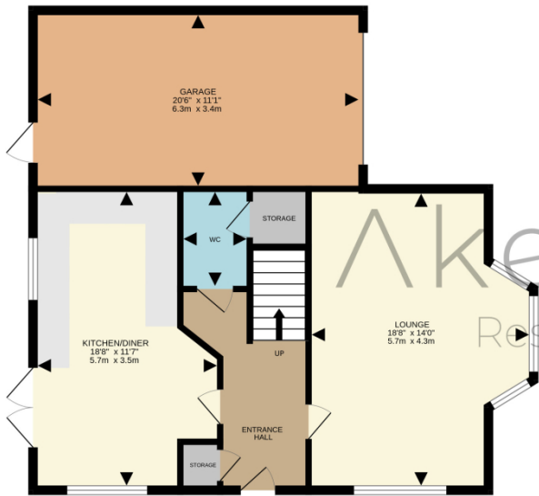
GROUND FLOOR 775 sq.ft. (72.0 sq.m.) approx.