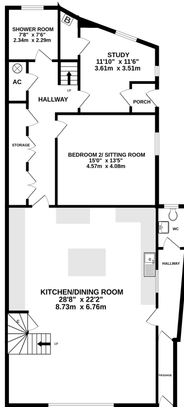
GROUND FLOOR 1322 sq.ft. (122.8 sq.m.) approx.