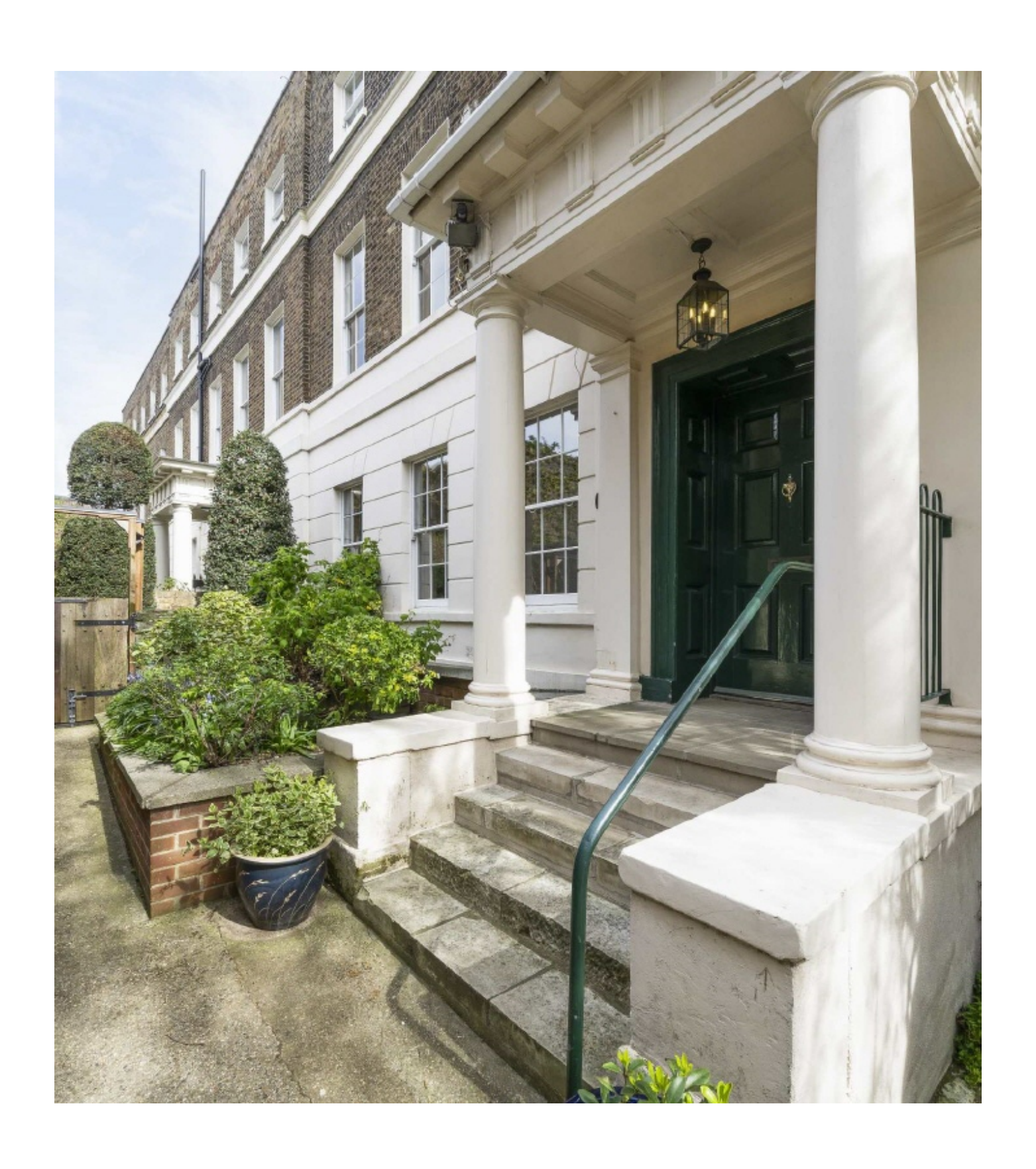
Aylmer Road, E11 £2,000,000