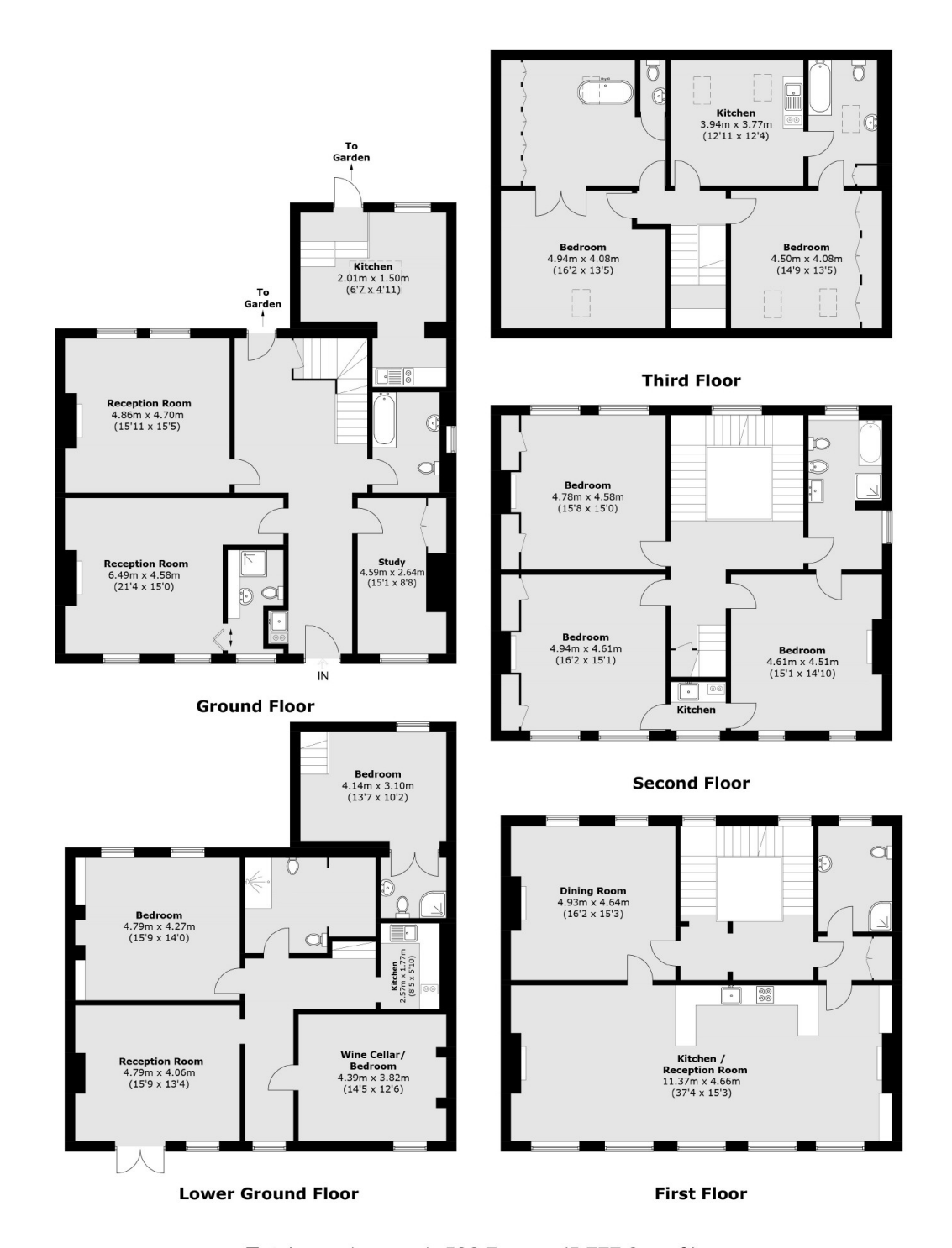
Total area (approx.): 536.7 sq. m (5,777.0 sq. ft)