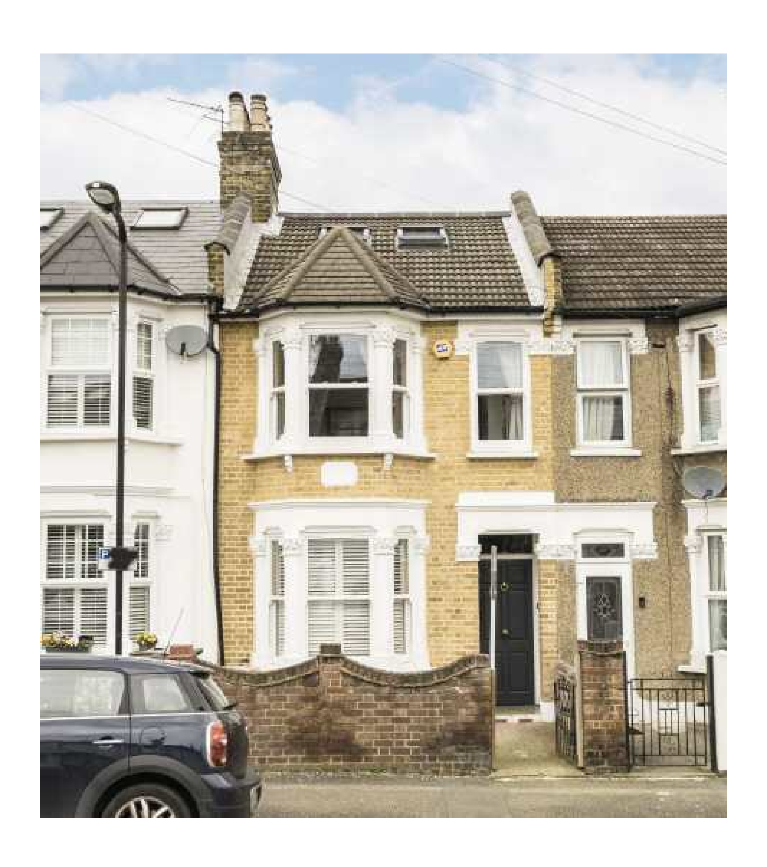
Carnarvon Road, E10 £850,000