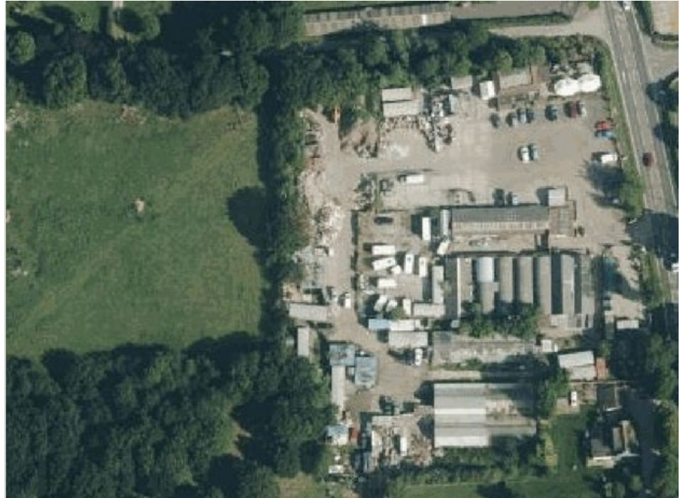
Hulbridge Road, Raleigh, POA