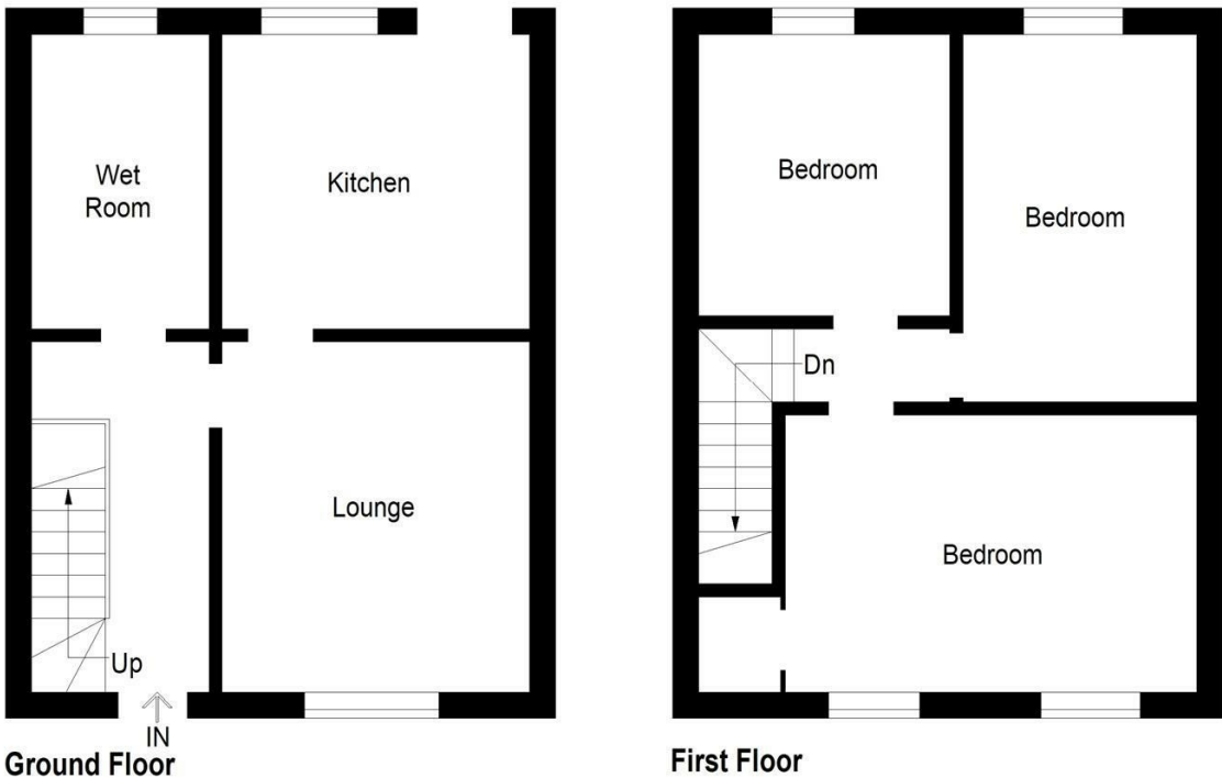
Illustration For Identification Purposes Only. Not To Scale (ID:1130351 / Ref:89361)

Approximate Gross Internal Area 87.4 sq m / 941 sq ft