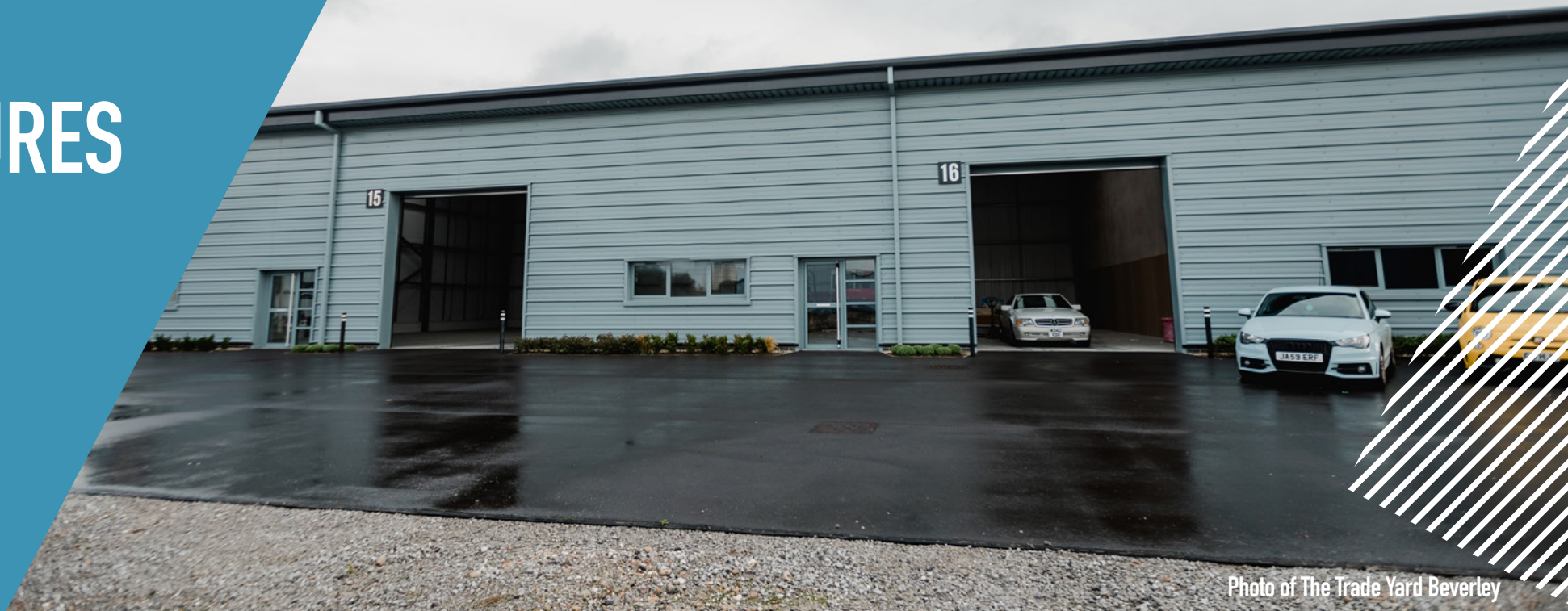
Photo of The Trade Yard Beverley

The Trade Yard Barton is a new development by leading developers, Allenby Commercial, with the vision to create main trade Hub with national names occupying the other units creating a one stop shop for businesses and DIYers, serving the urban and rural area of Barton District.