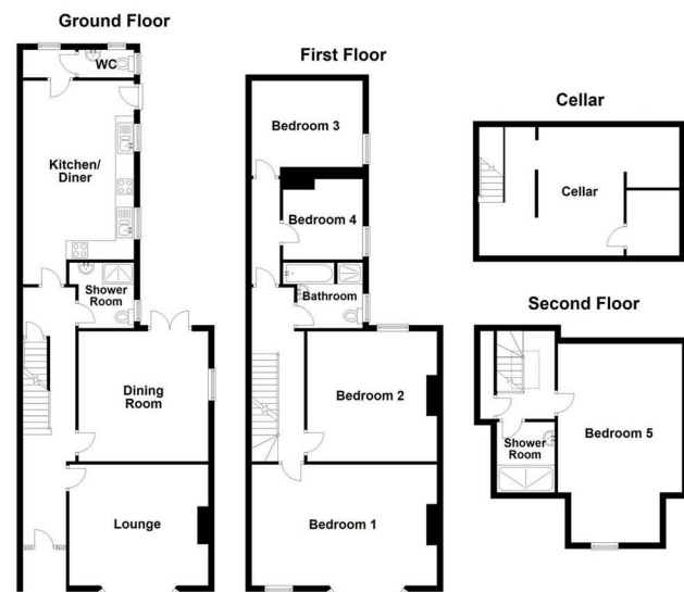
Not to scale. For illustrative purposes only

COUNCIL TAX Bedford council, BAND E PRICE INFORMATION Guides are provided as an indication of each seller's minimum expectation. They are not necessarily figures which a property will sell for and may change at any time prior to the auction. Each property will be offered subject to a Reserve (a figure below which the Auctioneer cannot sell the property during the auction) which we expect will be set within the Guide Range or no more than 10% above a single figure Guide. Additional Fees and Disbursements will be charged to the buyer - see individual property details and Special Conditions of Sale for actual figures. BUYERS ADMINISTRATION FEE The purchaser will be required to pay an administration charge of £1,140 (£950 plus VAT). BUYERS PREMIUM The purchaser will be required to pay a buyers premium charge of £2,400 (£2,000 plus VAT) HOW TO GET THERE From the M1 Junction 13, follow A421 to the A5141, at the roundabout junction with Ford End Road, go straight over to arrive at Rutland Road DOI200824SA/