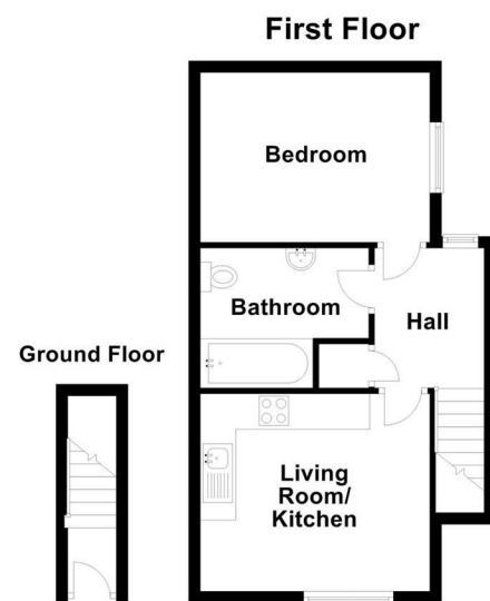
For illustration purposes only - not to scale