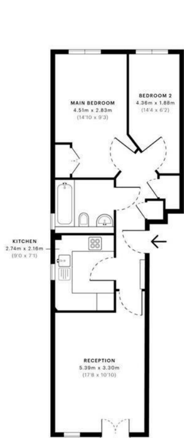
— First Floor

GROSS INTERNAL AREA 53.21 sqm / 572.75 sqft