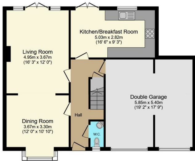
Ground Floor Floor area 84.1 m 2 (906 sq.ft.)