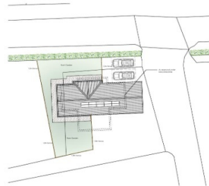
Alternative Site Plan 1:250 @ A1