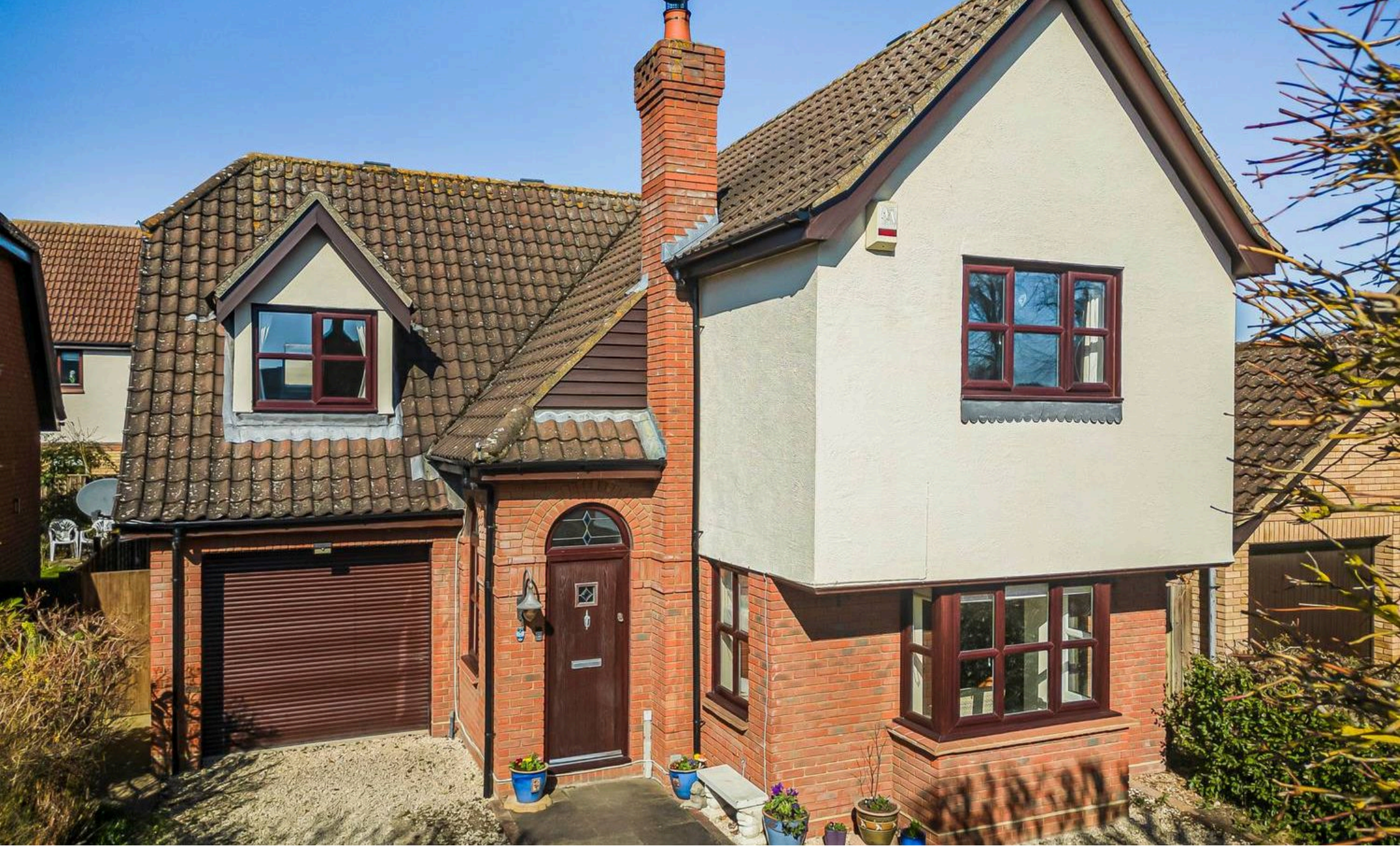
4 Tawny Crescent, Hartford