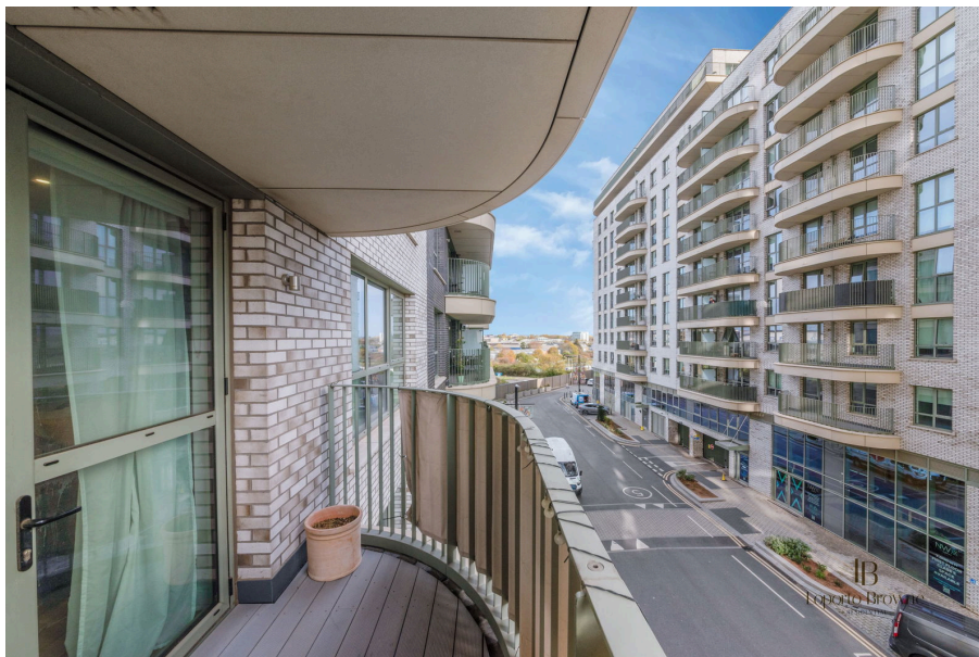
Lysander House Approx. Gross Internal Area 873 Sq Ft - 81.10 Sq M