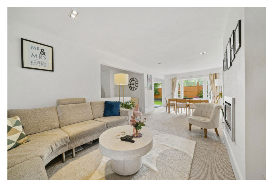
Tax Band: G Furnished: Unfurnished

A detached 5 bedroom family home, renovated to a high standard with a beautiful South East facing, private landscaped garden situated on Lydford Road, in the heart of the highly sought-after Mapesbury conservation area. A stroll away from the wonderful Gladstone Park, The Mapesbury Dell and Willesden Green Tube Station (Jubilee Line).