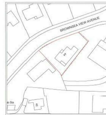
BLOCK PLAN: BASED ON ORDNANCE SURVEY EXTRACT O.S. LICENSE NO. - 100007080 SCALE 1:500