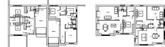
GROUND FLOOR PLAN SCALE 1:100