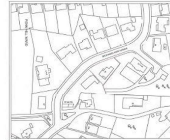
LOCATION PLAN: BASED ON ORDNANCE SURVEY EXTRACT O.S. LICENSE NO. - 100007080 SCALE 1:1250