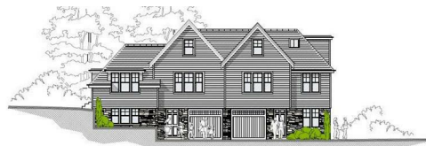
FRONT NORTH WEST ELEVATION SCALE 1:100