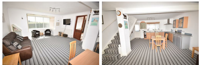
Annex Living/Kitchen/Dining Room 22'3" x 16'4"

Large Box window to rear elevation, separate staircase to Annex Bedroom and Bathroom only, door to garden room connecting main house, the kitchen area has a range units and worktop to two elevations with a freestanding electric cooker, with heavy duty perspex splash-back and stainless steel extractor above, space for under counter fridge and freezer, double bowl stainless steel sink with mixer tap.