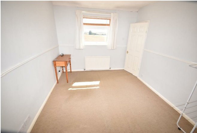
Bedroom 2 13'0" x 9'11"

Window to rear elevation and a storage cupboard recessed over the staircase with a louvered door.