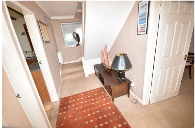
Inner Hallway 12'11" x 5'10"

Stairs to the main house landing, window to front elevation allowing light through from the office area, doors leading to kitchen, dining room and lounge.