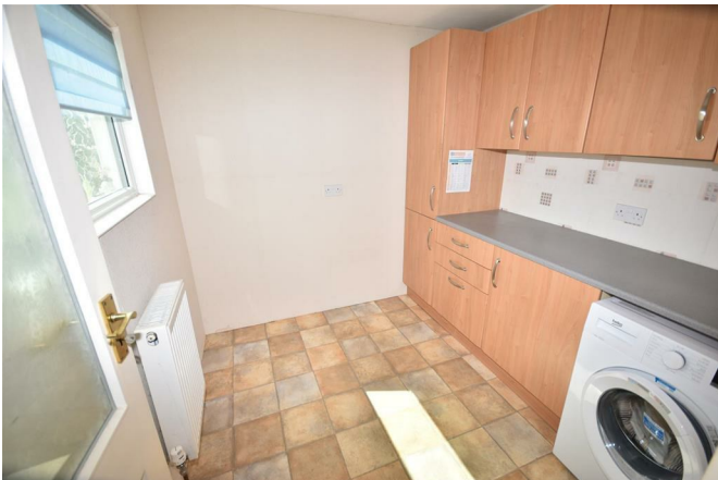
Utility 8'0" x 7'9"

Window to the conservatory allowing lots of light into this room, having a range of wall and base units with laminate worktop and plumbing for washing machine.