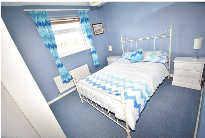
Bedroom 3 9'2" x 9'4"

Window to side elevation, with mirrored sliding doors to a double wardrobe.