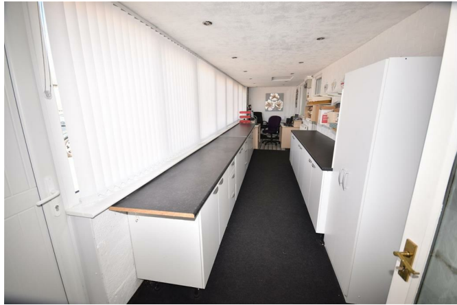
Office 8'0" x 32'2"

An incredible light and airy space having windows with vertical blinds across the entire length of the room, having lots of built in base storage units with laminate worktop over, windows to rear, allowing extra light into the main house inner hallway and the annexed kitchen/diner and door to the annex section of house.