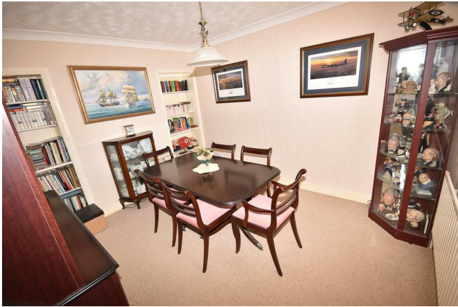
Dining Room 12'11" x 9'11"

Having window to rear elevation allowing light from garden room and shelving either side of chimney breast.