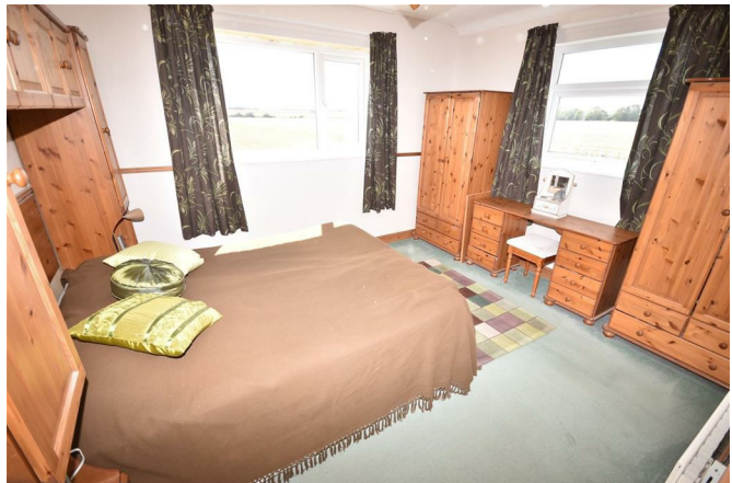
Bedroom 1 11'6" x 13'5"

Window to rear and side elevations with wardrobes built around and to the sides of the bed with the addition of two matching pine wardrobes and dressing table on the other wall.