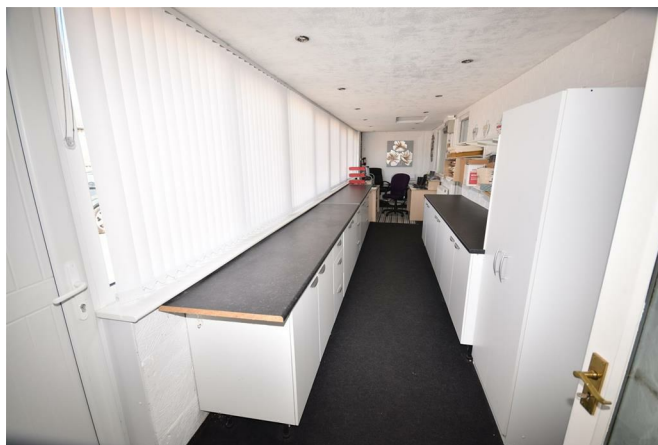
Office 8'0" x 32'2"

An incredible light and airy space having windows with vertical blinds across the entire length of the room, having lots of built in base storage units with laminate worktop over, windows to rear, allowing extra light into the main house inner hallway and the annexed kitchen/diner and door to the annex section of house.