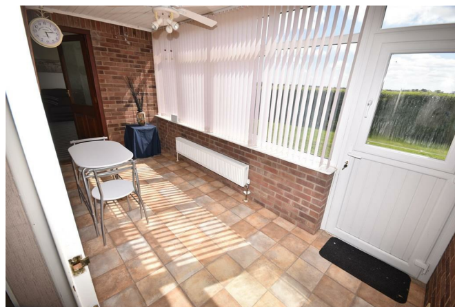
Garden Room 6'6" x 15'9"

Large window to rear elevation, entered through a upper glazed wooden door from the annex, having a UPVC stable door to the rear garden and double wooden doors into the inner hallway and a ceiling fan with light.