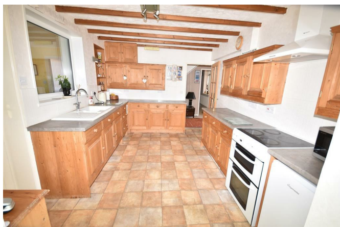
Kitchen 10'1" x 12'10"

Entered from either the inner hall, main entrance hall or through UPVC double doors off the conservatory, having an exposed beamed effect ceiling, a range of pine cottage style base and wall units with grey laminate worktop with mosaic splash-back tiling above, one and half bowl sink with mixer tap and window above, freestanding electric cooker with extractor hood and plinth heater,.