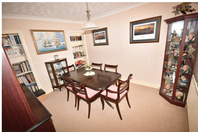
Dining Room 12'11" x 9'11"

Having window to rear elevation allowing light from garden room and shelving either side of chimney breast.